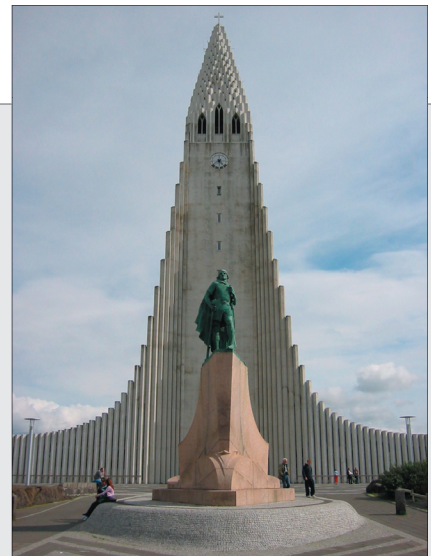
Hallgrim's Church with the statue of Leif Eiriksson (a gift to the Icelandic people from the U.S. in 1930).