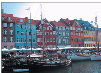
Nyhavn harbor, Copenhagen