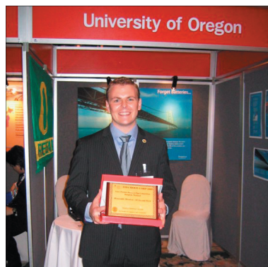
Representing the UO at Asia Moot 2005